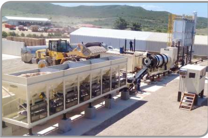
ASPHALT DRUM MIX PLANT

These are fully indigenous models of stationary and mobile plants upto 150 TPH capacity. Globally accepted Plants that have proved themselves in tough situations.