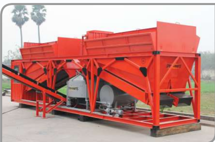
CONTAINERIZED CONCRETE PLANT

Our European menu includes these container type, fully integrated, automatic plants of 36 & 45 m 3 /hr capacity, with design from Europe.