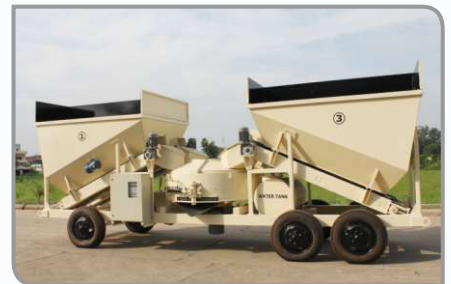
MOBILE CONCRETE PLANT

Compact design and fully automatic mobile concrete plant is manufactured upto 15 m 3 /hr capacity. Ease of erection and operation is the key feature of this plant.