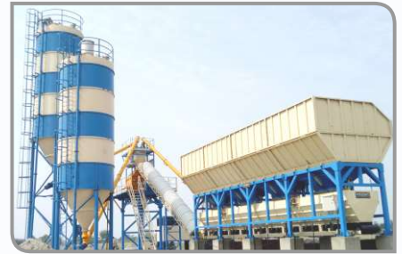
INLINE CONCRETE BATCHING PLANT

Fully automatic stationary plants upto 120 m 3 /hr capacity, available with design & mixer from Europe. These plants are highly advanced and durable.