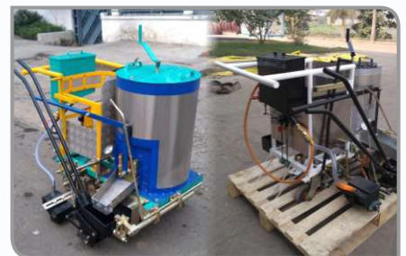
ROAD MARKING MACHINE

Push type Road Marking Machines are easy to operate, comes with 100 kg paint tank and glass bead dispenser. Semi Automatic and Self Propelled Machines are also available.