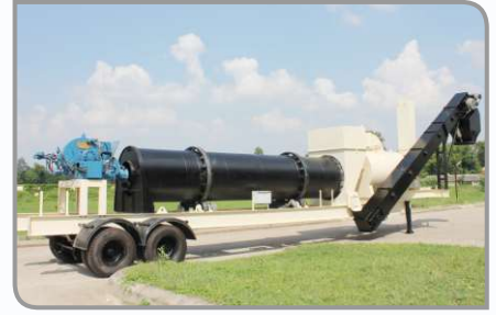
ASPHALT DRUM MIX PLANT (USA SPECS)

Asphalt Drum Mixing Plants are being manufactured upto 120 TPH capacity. These Plants are available both in mobile and stationary version.