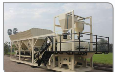
PORTABLE CONCRETE PLANT

These are highly Portable Concrete Plants & are available in 20 m 3 /hr capacity. Extremely useful for contractors on the move.