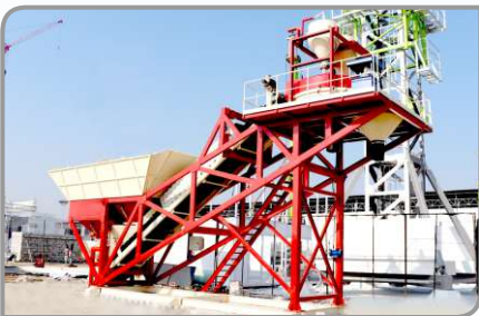
COMPACT CONCRETE PLANT

Highly compact and fully automatic Concrete Plant is available in 30 m 3 /hr capacity. Plant could be erected and dismantled in a day.