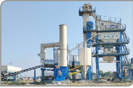
ASPHALT BATCH MIX PLANT

Asphalt Mixing Plants (batch type) are being manufactured with State of the art technology. These Plants are available from 80 to 200 TPH capacity.